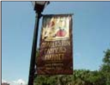
Charleston's Farmer's Market. A tradition and an attraction.