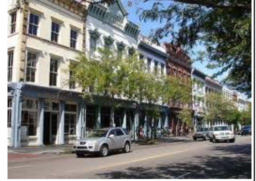
Historic Downtown Charleston offers much to keep tourists entertained as they enjoy its unique and charming beauty.